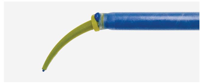
Leakage of material at the connection point between the Intra Oral Tip and the housing of the mixing tip

MIXPAC's Intra Oral Tips are meticulously matched to the housing of the mixing tip to ensure for optimal tightness with leakage.