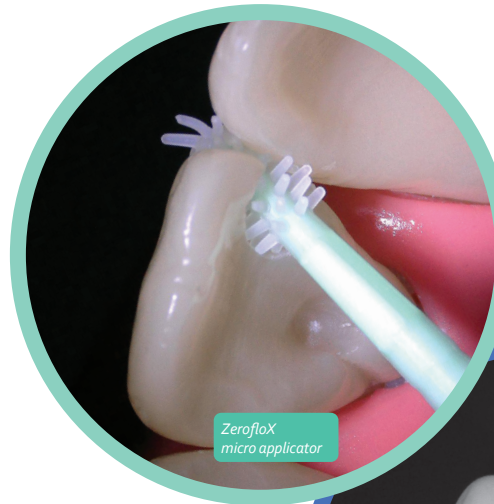
ZerofloX micro applicator

These images showcase the comparison between ZerofloX and competitive dental applicator* (size 2.0 mm). The competitive dental applicator (size 2.0 mm) is seen to only fill the front of the cavity, failing to reach the desired tooth area. In contrast, ZerofloX fits perfectly inside the cavity, effectively reaching the necessary tooth area.