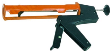
Figure 2: copy of medmix's MK H14 dispenser, by Jiangsu GTIG Huatai Co.

One counterfeiter, Jiangsu GTIG Huatai Co. of China, initially refused to sign a cease-and-desist declaration. However, as a result of medmix's significant sales, marketing, and enforcement efforts regarding its MK H14 dispenser, the District Court of Cologne granted, on March 5, a preliminary injunction ("einstweilige Verfügung") for medmix Switzerland Ltd. (plaintiff) against Jiangsu GTIG Huatai Co. (defendant, "GTIG"), forbidding the infringer from offering and selling in Germany the below copy of medmix's visually distinctive MK H14 dispenser: