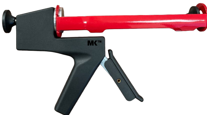
Figure 5: original MK H14RS from medmix.

medmix therefore strongly recommends that its customers look for the unique MK trade dress of its dispensers, with the MK trademark stamped on the distinctive handle of the MK dispensers (shown below for an MK H14 RS dispenser), to be assured that they are purchasing a high-quality MK dispenser manufactured according to medmix's strict quality control measures and protected by its guarantee.