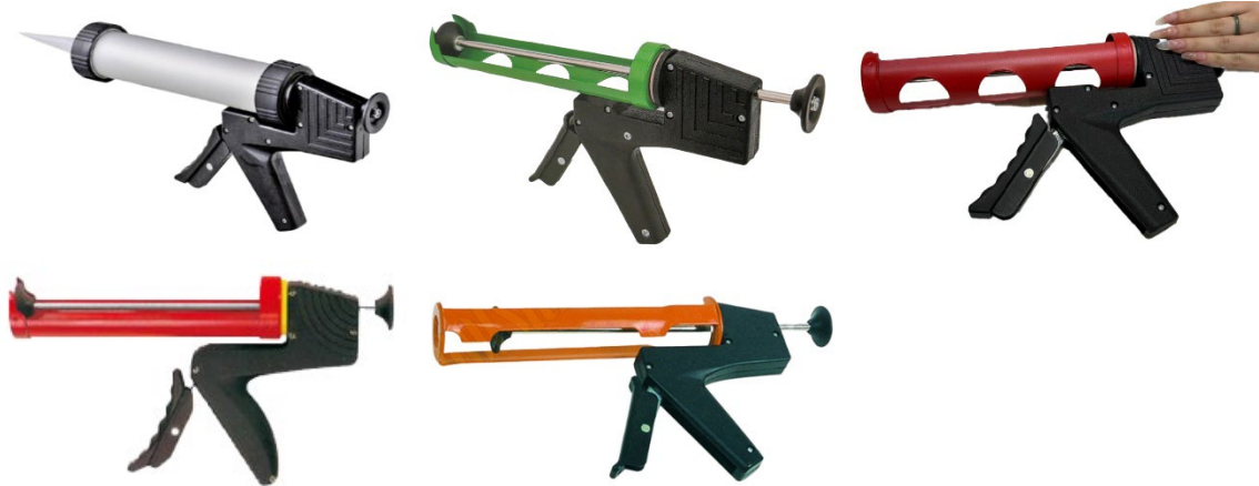
Figure 1: detected copies at the Eisenwaren Messe

One counterfeiter, Jiangsu GTIG Huatai Co. of China, initially refused to sign a cease-and-desist declaration. However, as a result of medmix's significant sales, marketing, and enforcement efforts regarding its MK H14 dispenser, the District Court of Cologne granted, on March 5, a preliminary injunction ("einstweilige Verfügung") for medmix Switzerland Ltd. (plaintiff) against Jiangsu GTIG Huatai Co. (defendant, "GTIG"), forbidding the infringer from offering and selling in Germany the below copy of medmix's visually distinctive MK H14 dispenser: