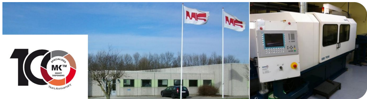
Caption: MK headquarters and production under the Krøger A/S brand