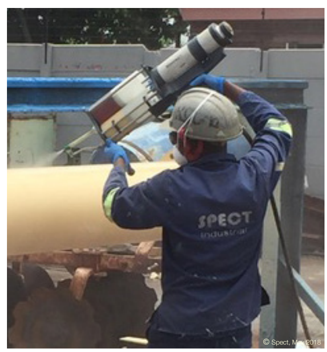
Mixpac MixCoat can even be used for coating of pipe fittings

Sulzer Mixpac Ltd Ruetistrasse 7 9469 Haag, Switzerland phone +41 81 772 2000 fax +41 81 772 2001 mixpac@sulzer.com www.sulzer.com